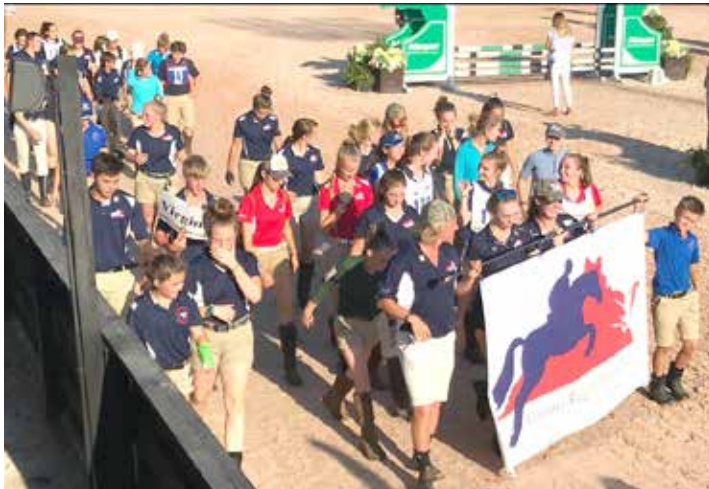
Opening ceremonies at the USPC Championships in Tryon, NC this summer. The Virginia Regional Pony Club sent 40 members to compete.